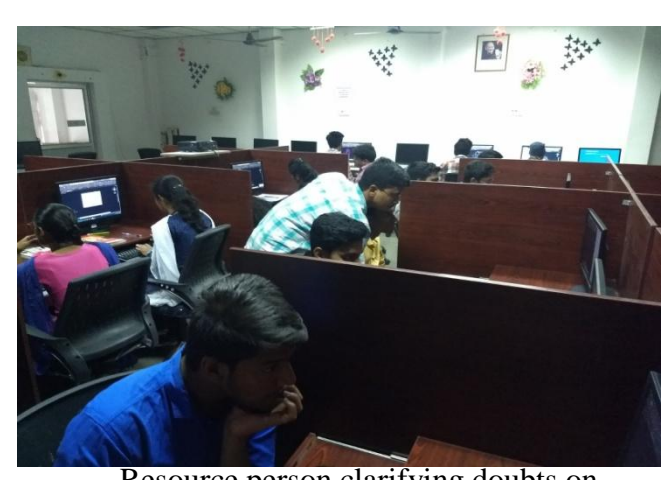
Resource person clarifying doubts on AUTOCAD